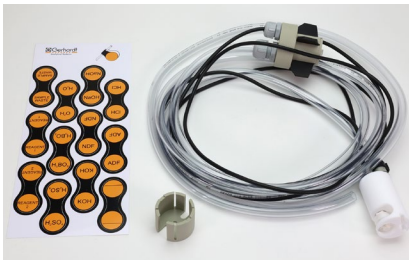
Universal level control 1005098